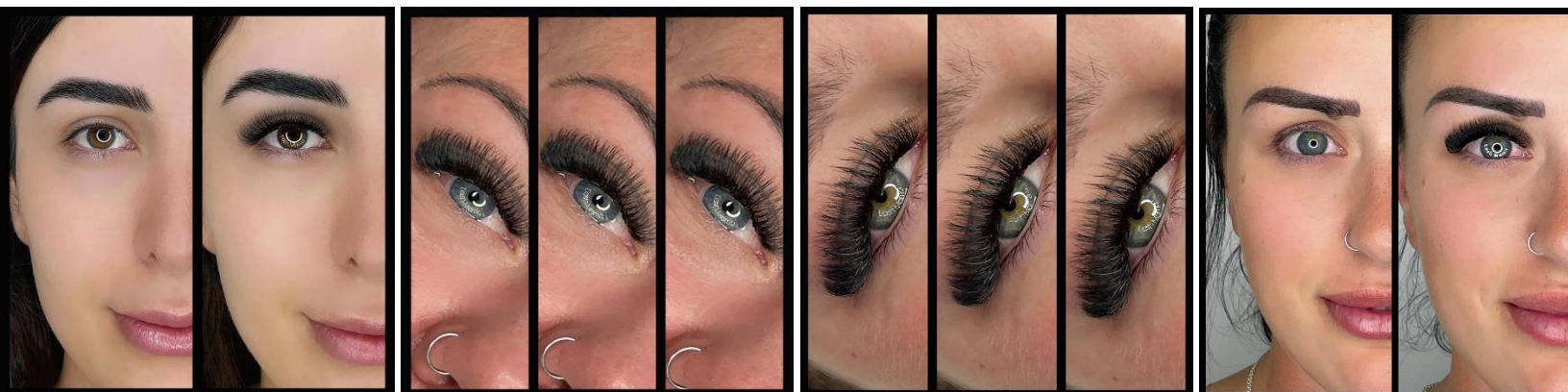
HYBDRID | VOLUME | MEGA VOLUME | RUSSIAN VOLUME